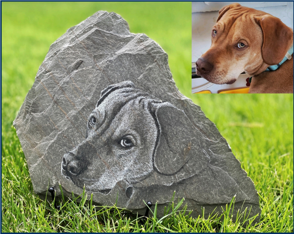
Napoleon, 10-12"ish Slab

First of all, thank you for your interest in commissioned work! I've drawn all kinds of subjects but keep coming back to animals. There's just so much personality in these creatures we share the planet with. I'm honored that you're thinking about ordering a custom illustration. This guide is designed to walk you through the process.