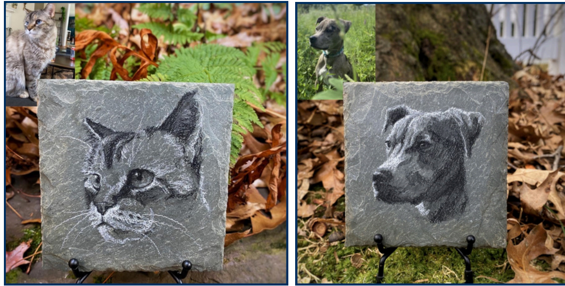
— Portraits of Pica and Cheeto, created on 4 x 4" slate tiles —

They say a picture is worth a thousand words... here are some examples of past commissioned work, along with the main reference photo I used for each portrait. You can find more examples on my website, SchweitzerStudios.com