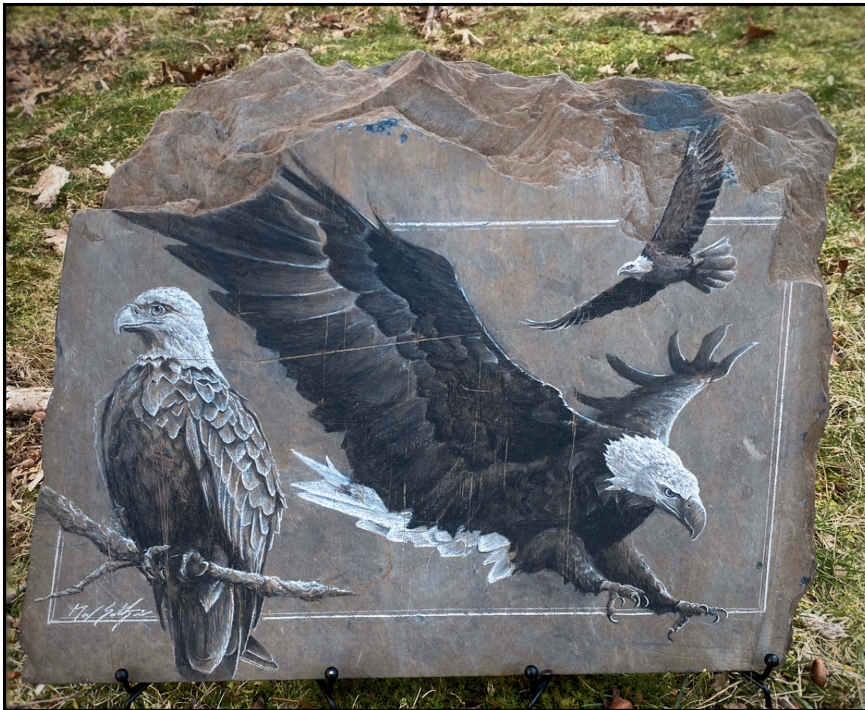
Custom Bald Eagle Tribute 20 x 24", provided by the customer

Occasionally someone will have something in mind that goes beyond the scope of my normal work! I love these projects. This eagle tribute was created for the top bald eagle rehabilitationist in the country... what a job! He provided the 24lb piece of slate and gave me free reign to create a tribute to our national bird. Let me know if you have an idea for something a bit outside the box! We'll work together on details and I'll create something special!