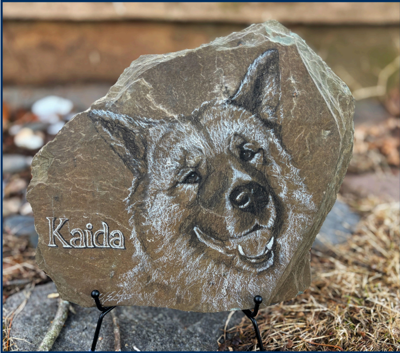
Kaida, 10x12"ish Slab