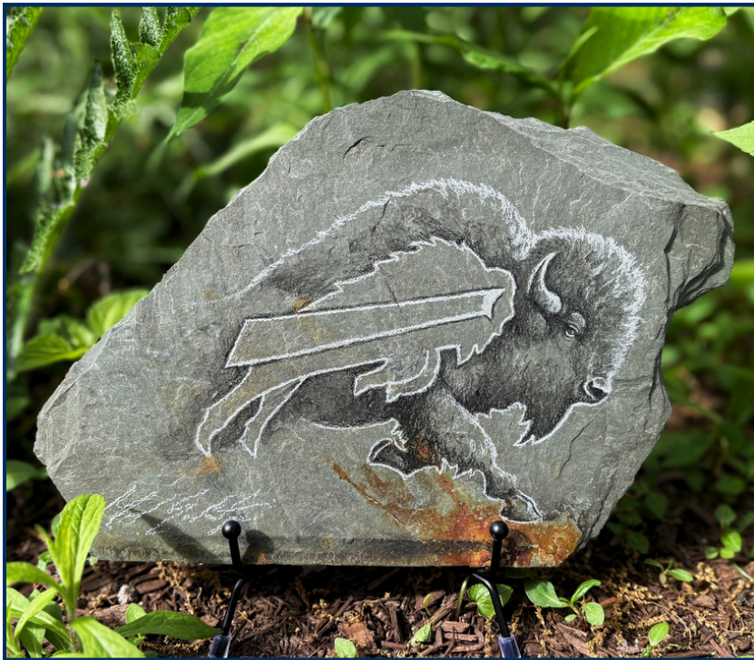
Custom Buffalo Bills Gift 6 x 8"ish Slab