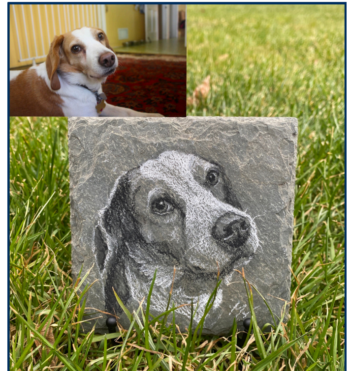
Brady 4 x 4" Coaster