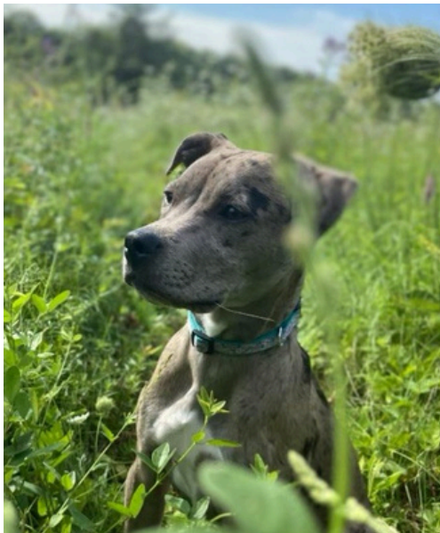
Cheeto ¾ pose, strong lighting, and high definition, captures his personality.