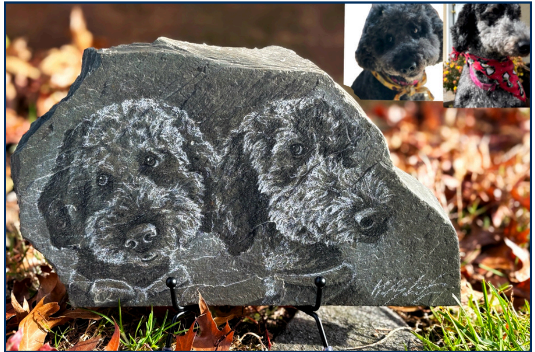
Bubbles and Waffles 6 x 8"ish Slab